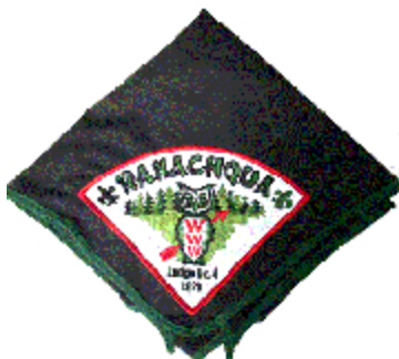
N15 - New Lodge Neckerchief

Price $2.50. Patch was originally issued to subsidize the Lodge's contingent at the 2002 NOAC at Indiana University. Produced by Stadri Emblems. Purchase is open to all.