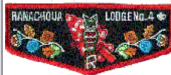
S31 - Ceremonies Team Fundraiser Flap

Price $5.00. Patch run of 300 by Moritz Embroidery. No reorders of this flap will be made. Purchase is restricted to active members of Ranachqua Lodge.