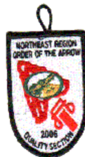
NE Region - 2006 Quality Section Award Patch

Price $15.00. These neckerchiefs are expected to be first available at the June 10th Lodge Meeting. Limited run of 100 by Stadri Emblems. No reorders of this neckerchief will be made. Purchase is restricted to active members of Ranachqua Lodge.