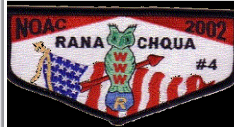
S27 - 2002 NOAC Fundraiser Flap

Price $15.00. Patch run of 100 by Moritz Embroidery. No reorders of this flap will be made. Purchase is restricted to active Vigil Honor members of Ranachqua Lodge. Quantity is restricted to 3 total per Vigil Honor member.